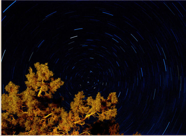
“Utah Sky” by Tim Starr