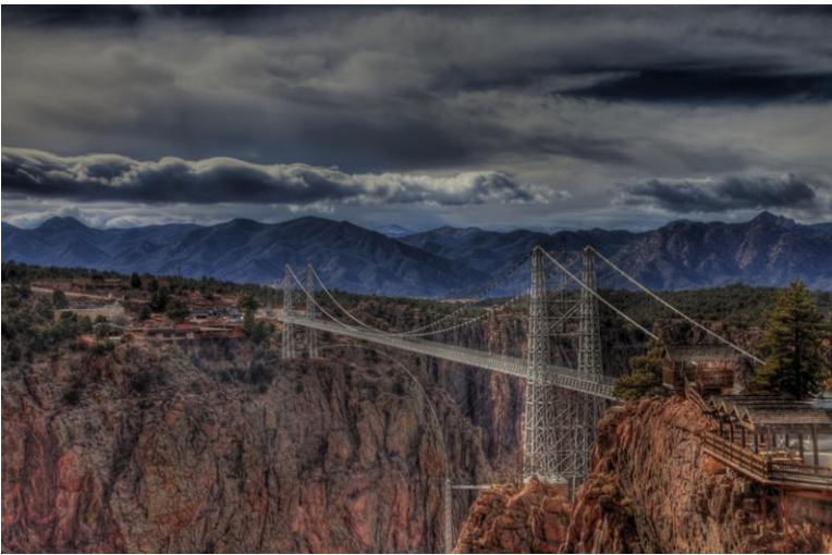
“Bridge” by T.W. Woodruff