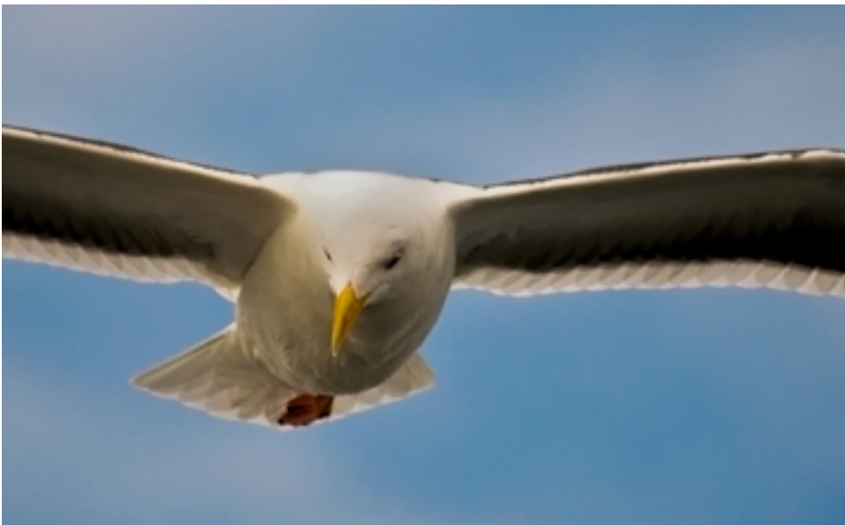
“Looking Up – A Birds Eye View” by Debi Boucher