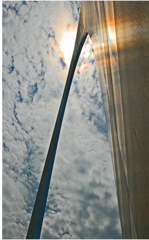
“Holding up the Sun” by Sherwood Cherry